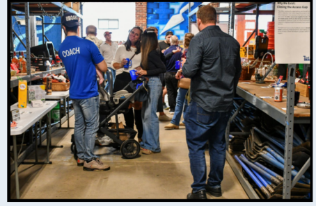
Snapshots of Hammers & Ales