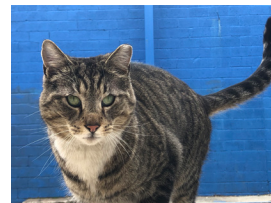
Flash QA Supervisor